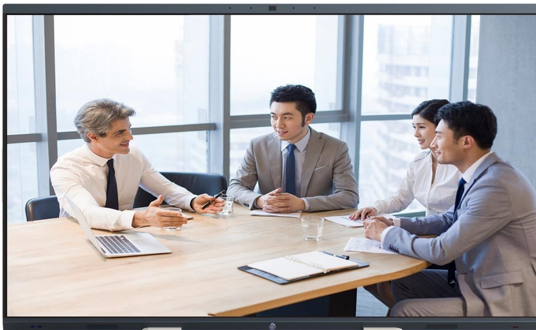
Camera & Microphone